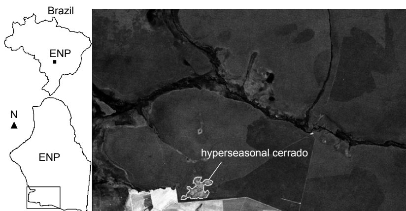
Fig. 1 — Location of Emas National Park in Brazil and the area covered by the hyperseasonal cerrado in the southwestern portion of the reserve.

randomly selected ten points. We used a Global Position System receiver to obtain these points. At each point, we collected soil samples at four depths (0-0.05, 0.05-0.25, 0.4-0.6, and 0.8-1.0 m) for chemical and granulometric analyses. During the soil sampling in the hyperseasonal cerrado, we also checked whether there was a lateritic layer up to 2 m deep. Chemical and granulometric analyses were conducted at the Soil Sciences Laboratory at the University of São Paulo.